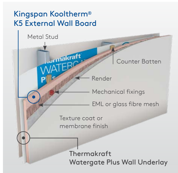
Figure 3. Insulated Render System on a Steel-framed Wall over a Cavity

The insulation core is resistant to short-term contact with petrol and with most dilute acids, alkalis and mineral oils. However, it is recommended that any spills be cleaned off fully before the boards are installed. Ensure that safe methods of cleaning are used, as recommended by suppliers of the spilt liquid. The insulation core is not resistant to some solvent-based adhesive systems, particularly those containing methyl ethyl ketone. Adhesives containing such solvents should not be used in association with this product. Damaged boards or boards that have been in contact with harsh solvents or acids should not be used.