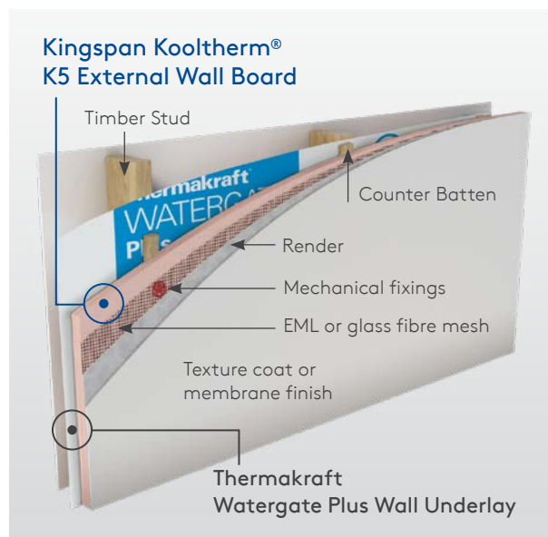
Figure 4. Insulated Render System on a Timber-framed Wall over a Cavity